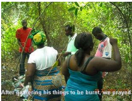
Praying over the place