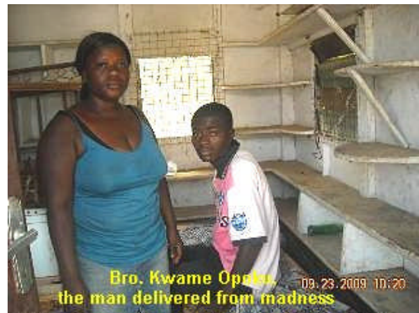
A new home