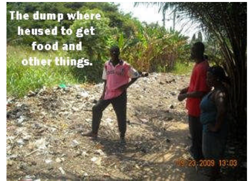
He shows them where he found food