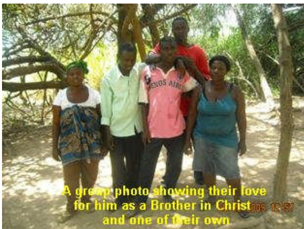
A new Brother-in-the-Lord