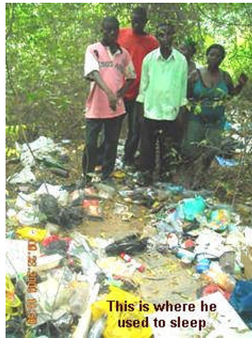
This is where he made his home